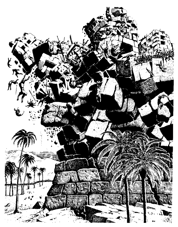
The walls of Jericho tumbling down at the final trumpet blast.

closed tight. The people had plenty of food and water, and the archers wouldn't even let the Israelites get close. God told Joshua: "I'm going to give you the city and all those who live in it. I want you to surround the city with all your soldiers and then march around it once each day for six days. Have seven priests go before the Ark of the Covenant with seven trumpets blowing. Then," God continued, "on the seventh day, march around the city of Jericho seven times. On the last time around, blow the trumpets with one long blast, and at the same time everyone will shout."