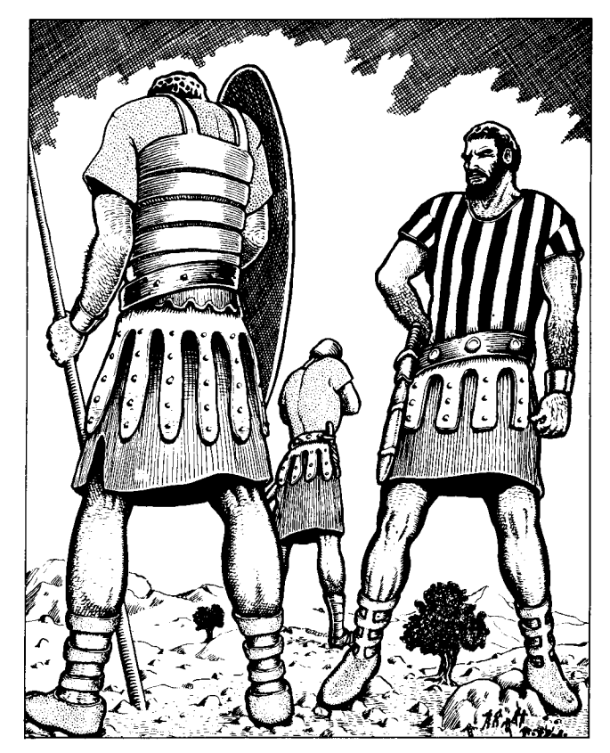
The people of Canaan were reported to be giants.

resurrected. These people will be given their first chance to learn God's laws and live their lives His way. For 100 years they will be judged accordingly.