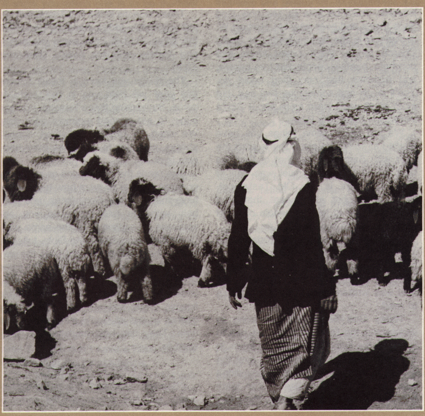
The Early Years